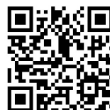
Grip Face Video