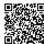
Grip Face Replacement PDF