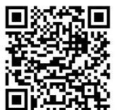
Grip Face Care PDF